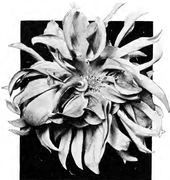
U. S. A.